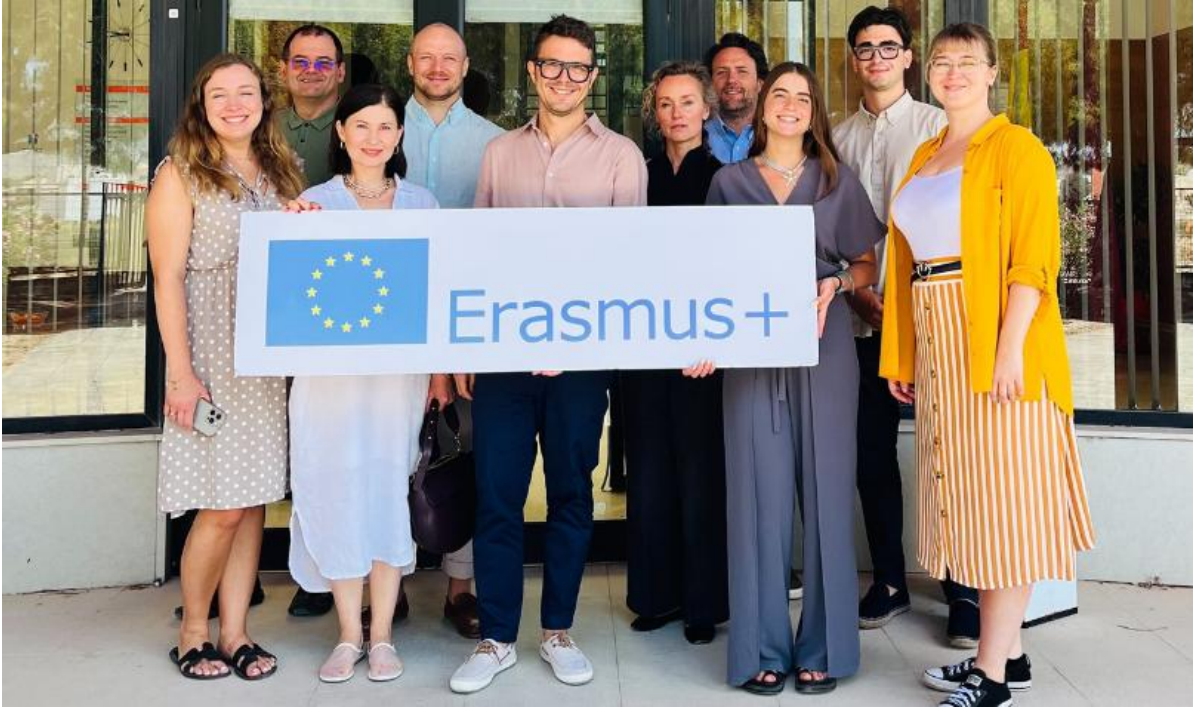
FURNITURELCA consortium at the meeting in Yecla, Spain (10.07.2025)